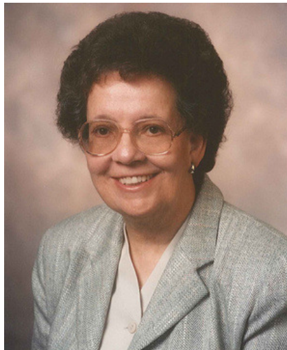
Select images available for purchase in the Times Leader Photo Store

Like Be the first of your friends to like this.